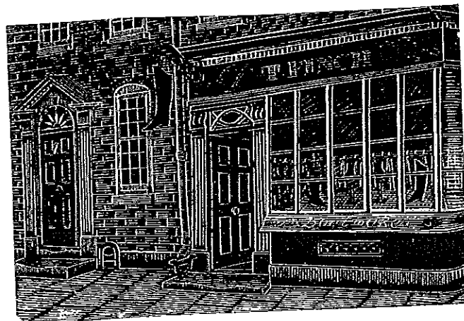
A couple more of the prints from 'Lark Rise to Candleford'