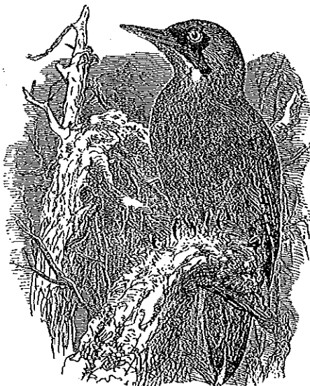
THE GREEN WOODPECKER.

The large one - may strike if we have a hard frost or snow and it has a taste for bees so pecks a hole in a hive to get a meal - protect your hives with loose net or chicken wire now!